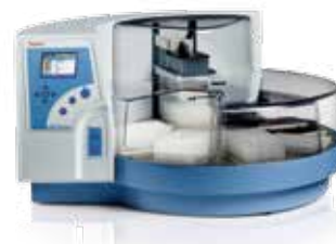
KingFisher Flex Purification Instrument

Manual sample preparation for lower throughput (throughput dependent on centrifuge capacity), semi-automated sample preparation processing with Applied Biosystems™ BeadRetriever™ Instrument (suitable for processing 15 samples per run) and Thermo Scientific™ KingFisher™ Flex Instrument (suitable for processing up to 96 samples per run).